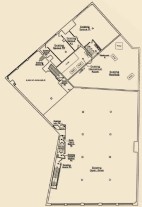
SECOND FLOOR 11,973 SF