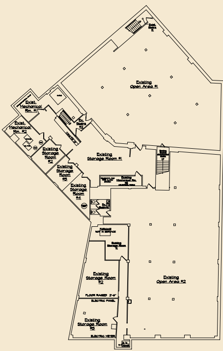
BASEMENT 14,033 SF