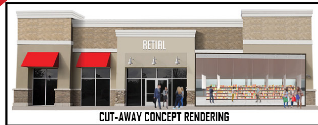
CUT-AWAY CONCEPT RENDERING